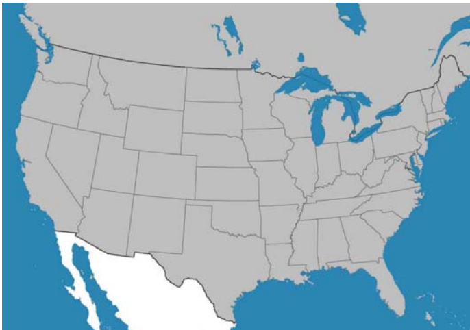
Distribution of Aedes vexans (in grey) in the U.S. and Canada

Adulticiding and larviciding are both effective means of controlling populations of Ae. vexans .