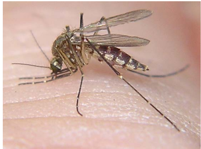
Adult female of Aedes vexans blood-feeding. Note the small pale bands encircling the legs.